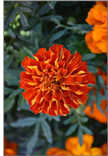
Durango Red Marigold flowers

Durango Red Marigold features bold semi-double brick red daisy flowers with gold eyes and gold edges at the ends of the stems from late spring to late summer. The flowers are excellent for cutting. Its fragrant ferny leaves remain dark green in color throughout the season.