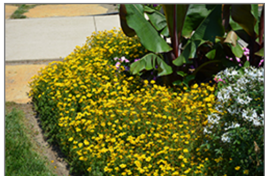
Goldilocks Rocks Bidens in bloom