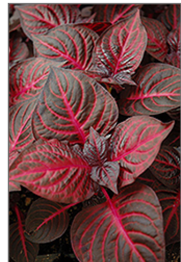
Blazin' Rose Blood Leaf foliage