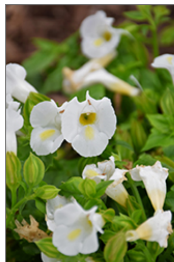
Catalina White Linen Torenia flowers