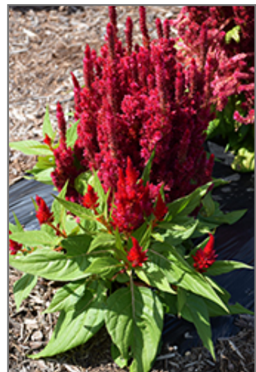
Fresh Look Red Celosia in bloom