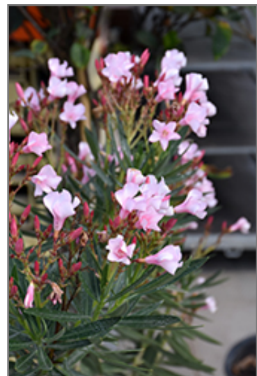
Oleander flowers