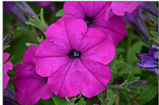
Easy Wave Violet Petunia flowers

Easy Wave Violet Petunia is a dense herbaceous annual with a trailing habit of growth, eventually spilling over the edges of hanging baskets and containers. Its medium texture blends into the garden, but can always be balanced by a couple of finer or coarser plants for an effective composition.