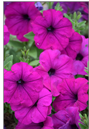
Easy Wave Violet Petunia flowers