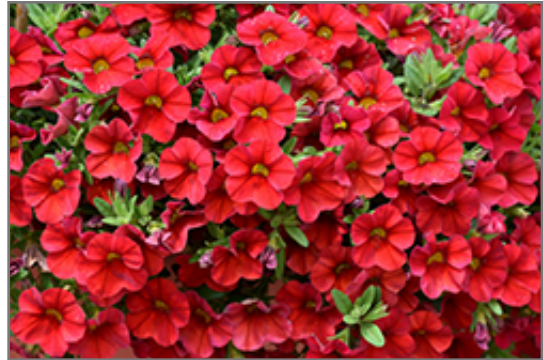
Superbells Red Calibrachoa flowers

Superbells Red Calibrachoa is recommended for the following landscape applications;