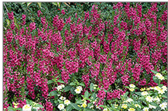
Archangel Dark Rose Angelonia in bloom