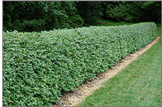
Winged Burning Bush

This shrub performs well in both full sun and full shade. It is very adaptable to both dry and moist locations, and should do just fine under average home landscape conditions. It is not particular as to soil type or pH. It is highly tolerant of urban pollution and will even thrive in inner city environments. This species is not originally from North America.