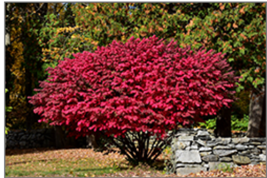
Winged Burning Bush in fall

Winged Burning Bush is recommended for the following landscape applications;