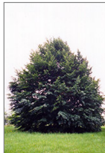
European Beech