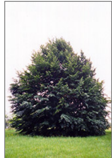
European Beech