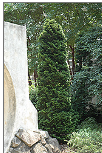
Dark Green Arborvitae

Dark Green Arborvitae will grow to be about 20 feet tall at maturity, with a spread of 7 feet. It has a low canopy with a typical clearance of 1 foot from the ground, and is suitable for planting under power lines. It grows at a slow rate, and under ideal conditions can be expected to live for 50 years or more.