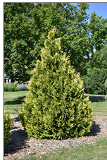
Yellow Ribbon Arborvitae