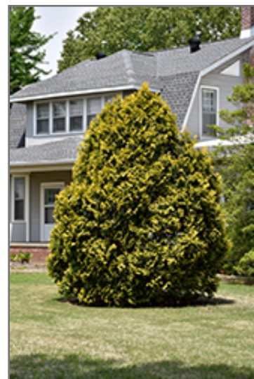
Yellow Ribbon Arborvitae