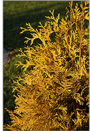
Yellow Ribbon Arborvitae in fall

This shrub does best in full sun to partial shade. It prefers to grow in average to moist conditions, and shouldn't be allowed to dry out. It is not particular as to soil type or pH. It is somewhat tolerant of urban pollution, and will benefit from being planted in a relatively sheltered location. Consider applying a thick mulch around the root zone in winter to protect it in exposed locations or colder microclimates. This is a selection of a native North American species.