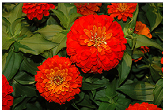
Dreamland Scarlet Zinnia flowers