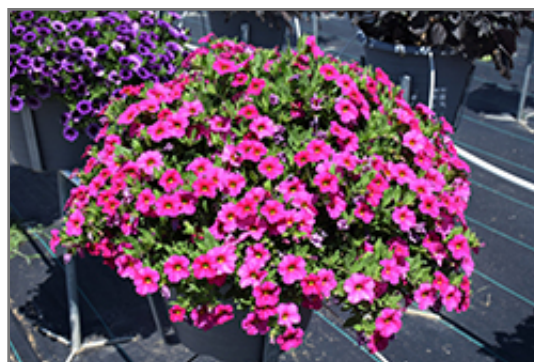
Callie Rose Calibrachoa in bloom