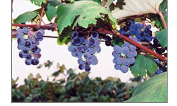
Concord Grape fruit