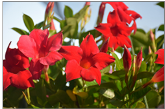
Sun Parasol Crimson Mandevilla flowers

This plant is native to the tropics and prefers growing in moist environments with evenly warm conditions all year round. In our climate, it is usually grown as an outdoor annual in the garden or in a container. If you want it to survive the winter, it can be brought in to the house and provided with special care, and then returned to the garden the following season. In its preferred tropical habitat, it can grow to be around 10 feet tall at maturity, with a spread of 24 inches. However, when grown as an annual or when overwintered indoors, it can be expected to perform differently, and its exact height and spread will depend on many factors; you may wish to consult with our experts as to how it might perform in your specific application and growing conditions.