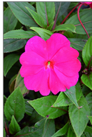
Divine Violet New Guinea Impatiens flowers

Divine Violet New Guinea Impatiens is recommended for the following landscape applications;