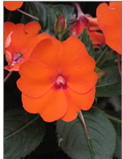
SunPatens Compact Electric Orange New Guinea Impatiens flowers

This plant will require occasional maintenance and upkeep, and should not require much pruning, except when necessary, such as to remove dieback. It is a good choice for attracting bees and butterflies to your yard. It has no significant negative characteristics.