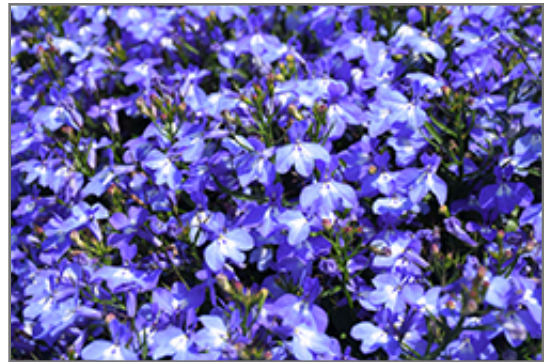
Techno Light Blue Lobelia flowers

Techno Light Blue Lobelia is recommended for the following landscape applications;