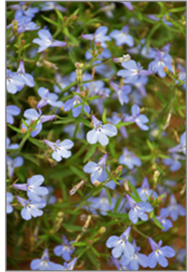
Techno Light Blue Lobelia flowers

Techno Light Blue Lobelia will grow to be about 8 inches tall at maturity, with a spread of 12 inches. When grown in masses or used as a bedding plant, individual plants should be spaced approximately 10 inches apart. Its foliage tends to remain low and dense right to the ground. Although it's not a true annual, this fast-growing plant can be expected to behave as an annual in our climate if left outdoors over the winter, usually needing replacement the following year. As such, gardeners should take into consideration that it will perform differently than it would in its native habitat.