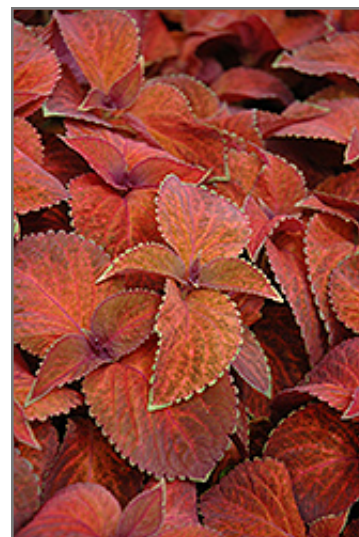
Wizard Sunset Coleus foliage

Wizard Sunset Coleus is recommended for the following landscape applications;