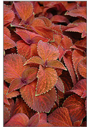
Wizard Sunset Coleus foliage

Wizard Sunset Coleus is recommended for the following landscape applications;