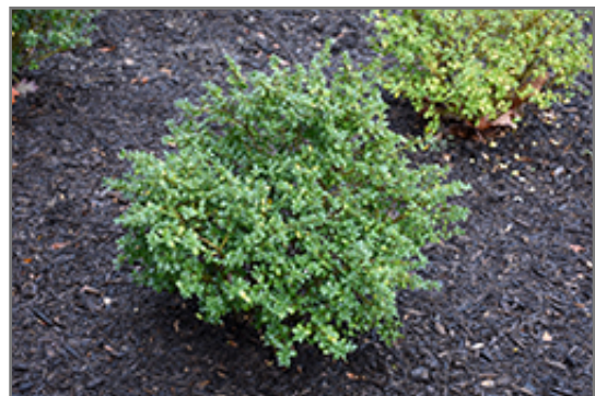
Green Lustre Japanese Holly