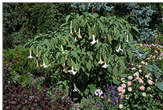
White Angel's Trumpet in bloom