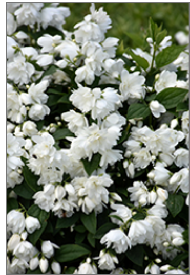
Snowbelle Mockorange flowers