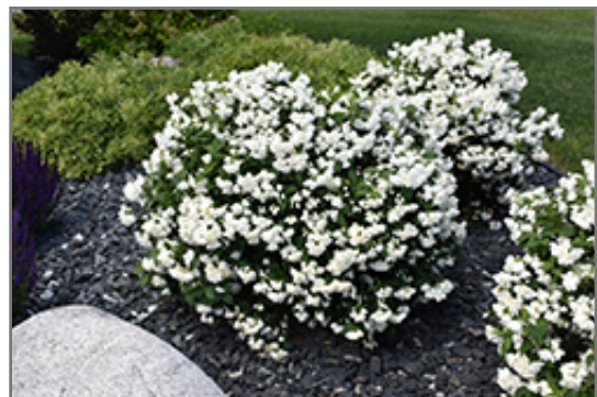
Snowbelle Mockorange in bloom