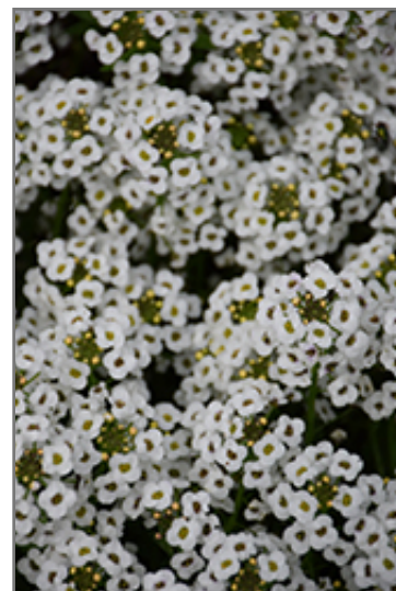
Stream White Sweet Alyssum flowers

Stream White Sweet Alyssum is recommended for the following landscape applications;