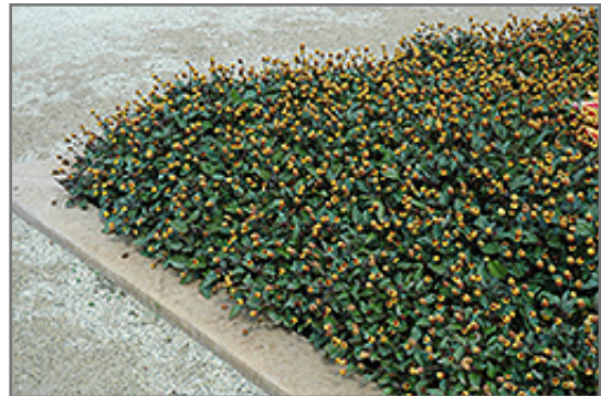
Peek A Boo Para Cress in bloom

Peek A Boo Para Cress is recommended for the following landscape applications;