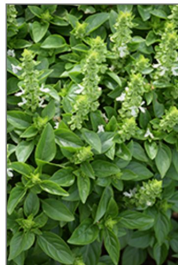
Spicy Globe Basil foliage

Spicy Globe Basil will grow to be about 12 inches tall at maturity, with a spread of 12 inches. When grown in masses or used as a bedding plant, individual plants should be spaced approximately 10 inches apart. This fast-growing annual will normally live for one full growing season, needing replacement the following year.