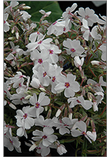
Amazing Grace Moss Phlox flowers

This variety produces a showy display of bright white flowers with golden centers surrounded by maroon-pink spots; prune lightly after flowering to encourage a dense growth habit; wonderful for rock gardens, edging, or in mixed containers