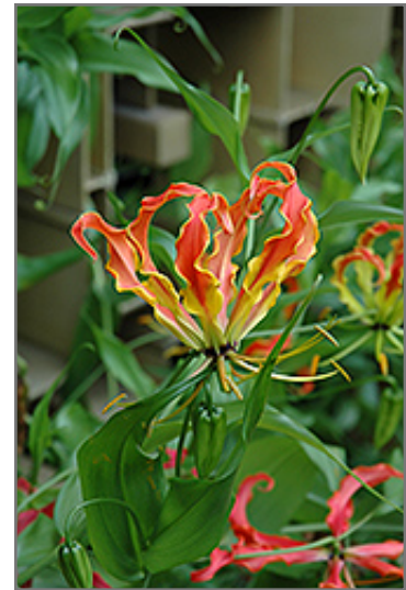
Gloriosa Lily flowers

Gloriosa Lily is recommended for the following landscape applications;