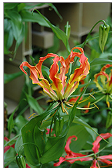
Gloriosa Lily flowers

Gloriosa Lily is recommended for the following landscape applications;