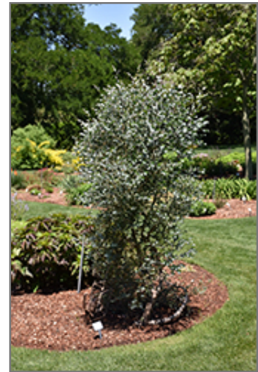
Silver Drop Cider Gum

Silver Drop Cider Gum makes a fine choice for the outdoor landscape, but it is also well-suited for use in outdoor pots and containers. With its upright habit of growth, it is best suited for use as a 'thriller' in the 'spiller-thriller-filler' container combination; plant it near the center of the pot, surrounded by smaller plants and those that spill over the edges. It is even sizeable enough that it can be grown alone in a suitable container. Note that when grown in a container, it may not perform exactly as indicated on the tag - this is to be expected. Also note that when growing plants in outdoor containers and baskets, they may require more frequent waterings than they would in the yard or garden. Be aware that in our climate, this plant may be too tender to survive the winter if left outdoors in a container. Contact our experts for more information on how to protect it over the winter months.