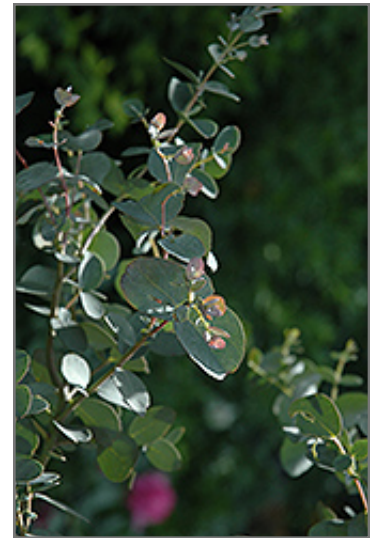
Silver Drop Cider Gum foliage