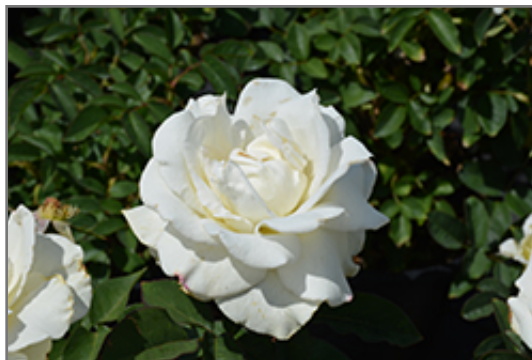
John F. Kennedy Rose in bloom