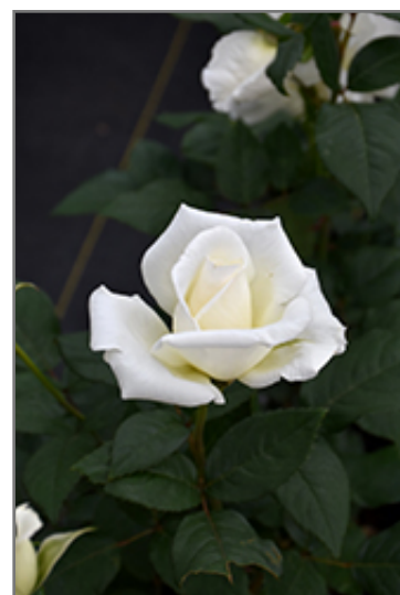
John F. Kennedy Rose flowers