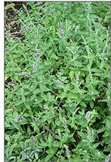
Pennyroyal in bloom