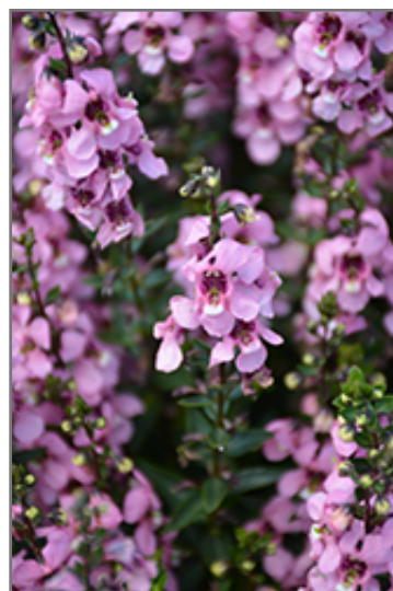
Serenita Pink Angelonia flowers