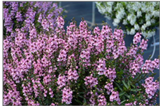
Serenita Pink Angelonia in bloom