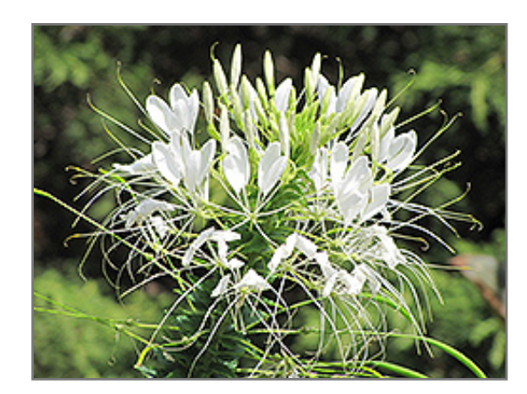
Sparkler White Spiderflower flowers