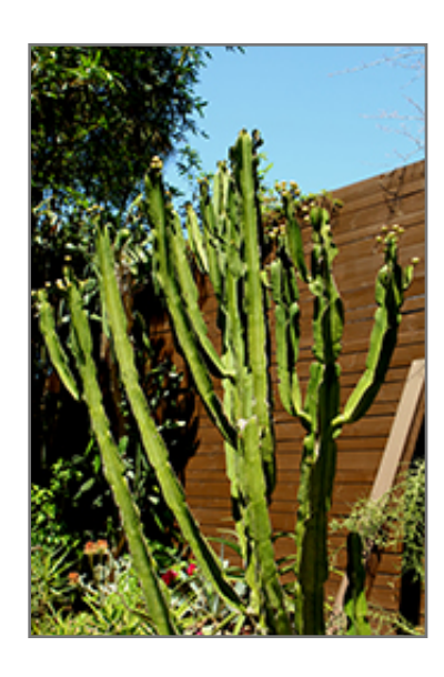
Candelabra Tree