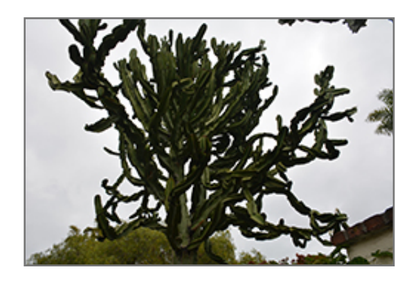
Candelabra Tree

This tree does best in full sun to partial shade. It prefers dry to average moisture levels with very well-drained soil, and will often die in standing water. It is considered to be drought-tolerant, and thus makes an ideal choice for xeriscaping or the moisture-conserving landscape. It is not particular as to soil pH, but grows best in sandy soils. It is highly tolerant of urban pollution and will even thrive in inner city environments. This species is not originally from North America, and parts of it are known to be toxic to humans and animals, so care should be exercised in planting it around children and pets.