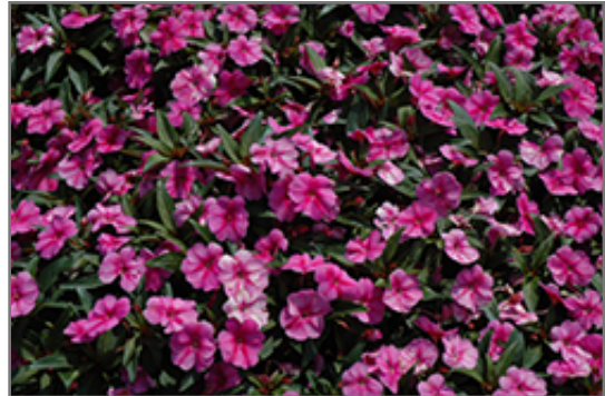
Bounce Pink Flame Impatiens flowers

Bounce Pink Flame Impatiens is recommended for the following landscape applications;