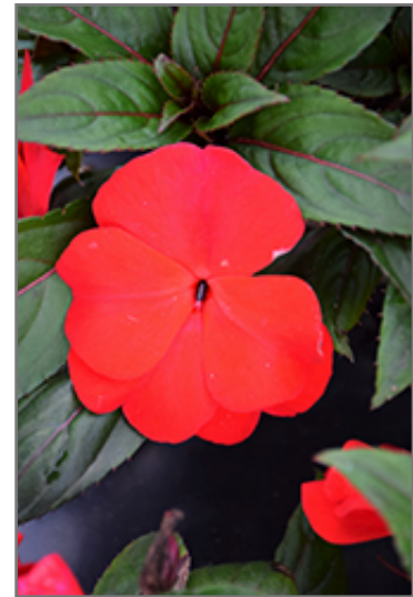
Divine Scarlet Bronze Leaf New Guinea Impatiens flowers

This plant will require occasional maintenance and upkeep, and should not require much pruning, except when necessary, such as to remove dieback. It has no significant negative characteristics.