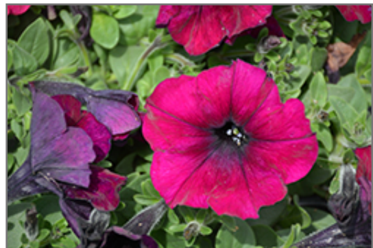
Easy Wave Burgundy Velour Petunia flowers