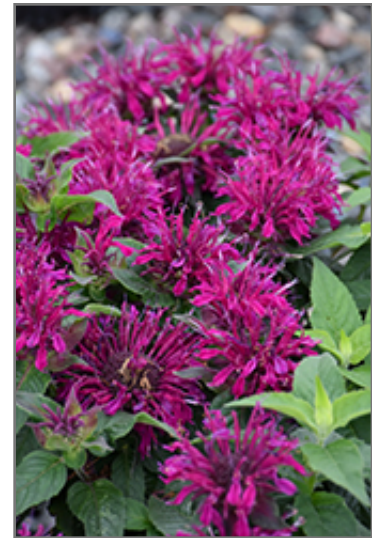
Balmy Purple Beebalm flowers

This plant will require occasional maintenance and upkeep, and should be cut back in late fall in preparation for winter. It is a good choice for attracting bees, butterflies and hummingbirds to your yard, but is not particularly attractive to deer who tend to leave it alone in favor of tastier treats. Gardeners should be aware of the following characteristic(s) that may warrant special consideration;