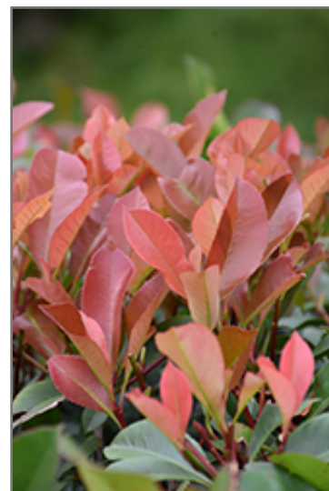
Red Tip Photinia foliage