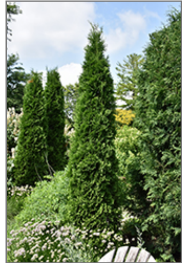
American Pillar Arborvitae

American Pillar Arborvitae will grow to be about 25 feet tall at maturity, with a spread of 6 feet. It has a low canopy with a typical clearance of 1 foot from the ground, and is suitable for planting under power lines. It grows at a fast rate, and under ideal conditions can be expected to live for 50 years or more.