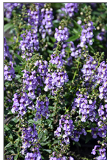
Serenita Sky Blue Angelonia flowers

Serenita Sky Blue Angelonia is an herbaceous annual with an upright spreading habit of growth. Its relatively fine texture sets it apart from other garden plants with less refined foliage.