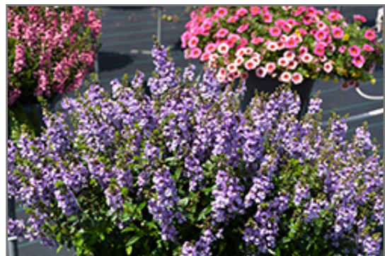
Serenita Sky Blue Angelonia in bloom