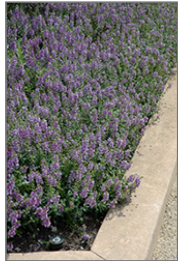
Serenita Sky Blue Angelonia in bloom

Serenita Sky Blue Angelonia is a fine choice for the garden, but it is also a good selection for planting in outdoor containers and hanging baskets. It is often used as a 'filler' in the 'spiller-thriller-filler' container combination, providing a mass of flowers against which the larger thriller plants stand out. Note that when growing plants in outdoor containers and baskets, they may require more frequent waterings than they would in the yard or garden.