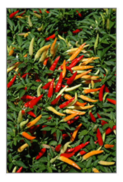
Basket Of Fire Ornamental Pepper fruit

Basket Of Fire Ornamental Pepper is an herbaceous annual with an upright spreading habit of growth. Its medium texture blends into the garden, but can always be balanced by a couple of finer or coarser plants for an effective composition.