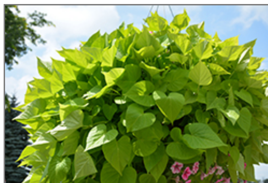
Sweet Caroline Sweetheart Lime Sweet Potato Vine