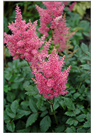
Rheinland Astilbe flowers

Rheinland Astilbe is recommended for the following landscape applications;