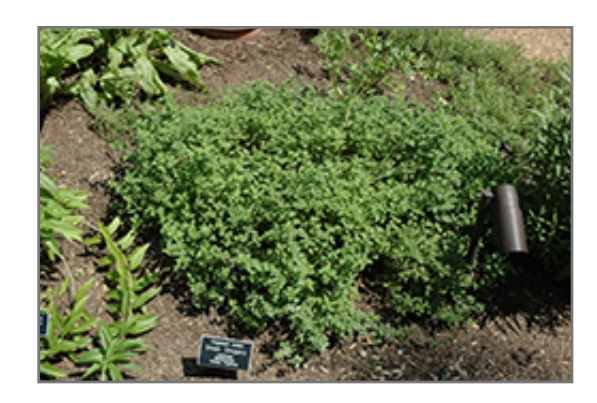
Greek Oregano