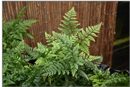
White Rabbit's Foot Fern foliage

When grown indoors, White Rabbit's Foot Fern can be expected to grow to be about 12 inches tall at maturity, with a spread of 18 inches. It grows at a medium rate, and under ideal conditions can be expected to live for approximately 10 years. This houseplant performs well in both bright or indirect sunlight and strong artificial light, and can therefore be situated in almost any well-lit room or location. It does best in average to evenly moist soil, but will not tolerate standing water. The surface of the soil shouldn't be allowed to dry out completely, and so you should expect to water this plant once and possibly even twice each week. Be aware that your particular watering schedule may vary depending on its location in the room, the pot size, plant size and other conditions; if in doubt, ask one of our experts in the store for advice. It is not particular as to soil pH, but grows best in rich soil. Contact the store for specific recommendations on pre-mixed potting soil for this plant.