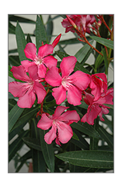
Oleander flowers

Oleander features showy clusters of hot pink star-shaped flowers along the branches from early to late summer. Its narrow leaves remain grayish green in color throughout the year.