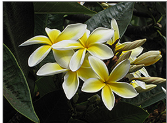
Common Frangipani flowers

When grown indoors, Common Frangipani can be expected to grow to be about 4 feet tall at maturity, with a spread of 4 feet. It grows at a medium rate, and under ideal conditions can be expected to live for approximately 30 years. This houseplant will do well in a location that gets either direct or indirect sunlight, although it will usually require a more brightly-lit environment than what artificial indoor lighting alone can provide. It is very adaptable to both dry and moist soil, and should do just fine under average home conditions. The surface of the soil shouldn't be allowed to dry out completely, and so you should expect to water this plant once and possibly even twice each week. Be aware that your particular watering schedule may vary depending on its location in the room, the pot size, plant size and other conditions; if in doubt, ask one of our experts in the store for advice. It is not particular as to soil pH, but grows best in sandy soil. Contact the store for specific recommendations on pre-mixed potting soil for this plant. Be warned that parts of this plant are known to be toxic to humans and animals, so special care should be exercised if growing it around children and pets.