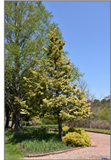
Cripps Gold Falsecypress

This tree does best in full sun to partial shade. It prefers to grow in average to moist conditions, and shouldn't be allowed to dry out. It is not particular as to soil type or pH. It is highly tolerant of urban pollution and will even thrive in inner city environments, and will benefit from being planted in a relatively sheltered location. Consider applying a thick mulch around the root zone in winter to protect it in exposed locations or colder microclimates. This is a selected variety of a species not originally from North America.