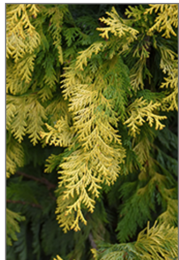
Cripps Gold Falsecypress foliage